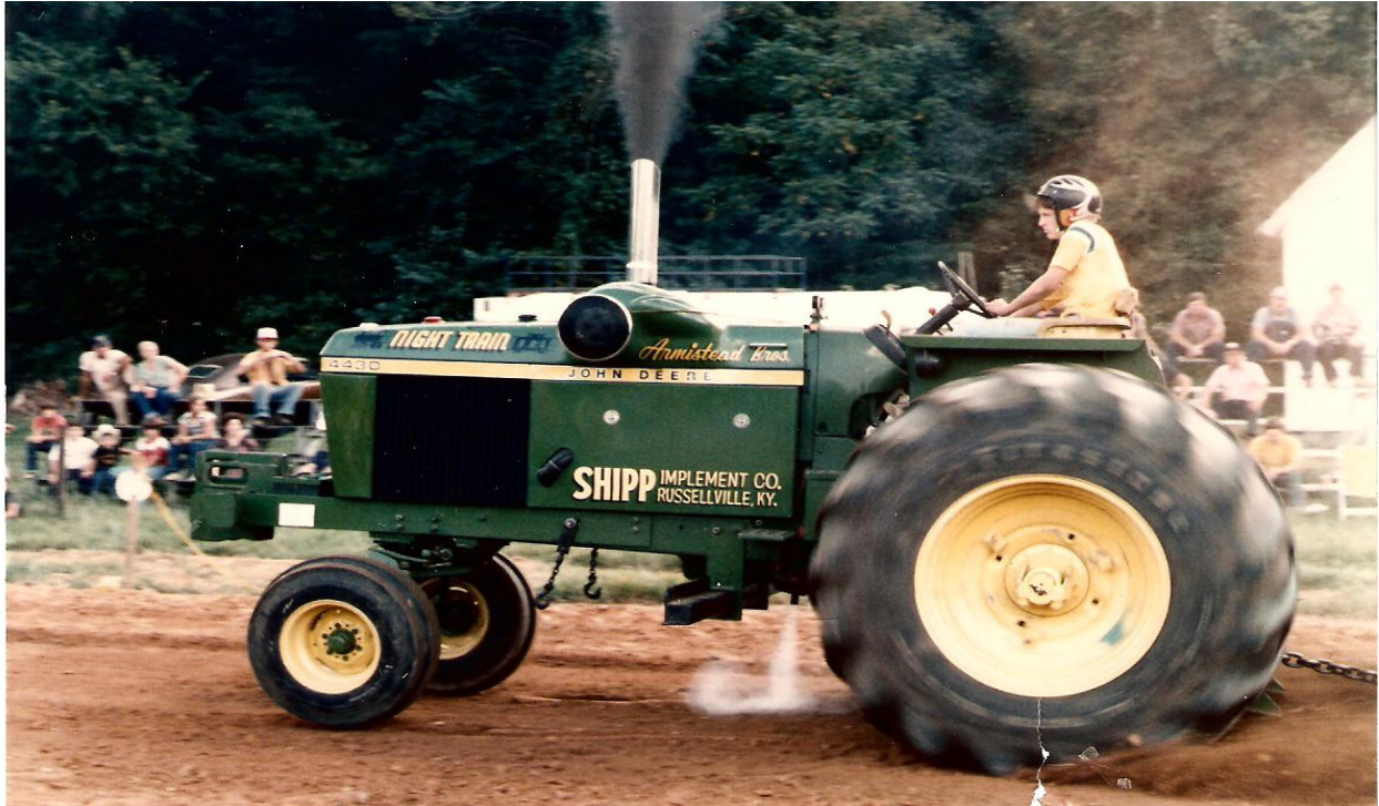
More Night Train pictures.