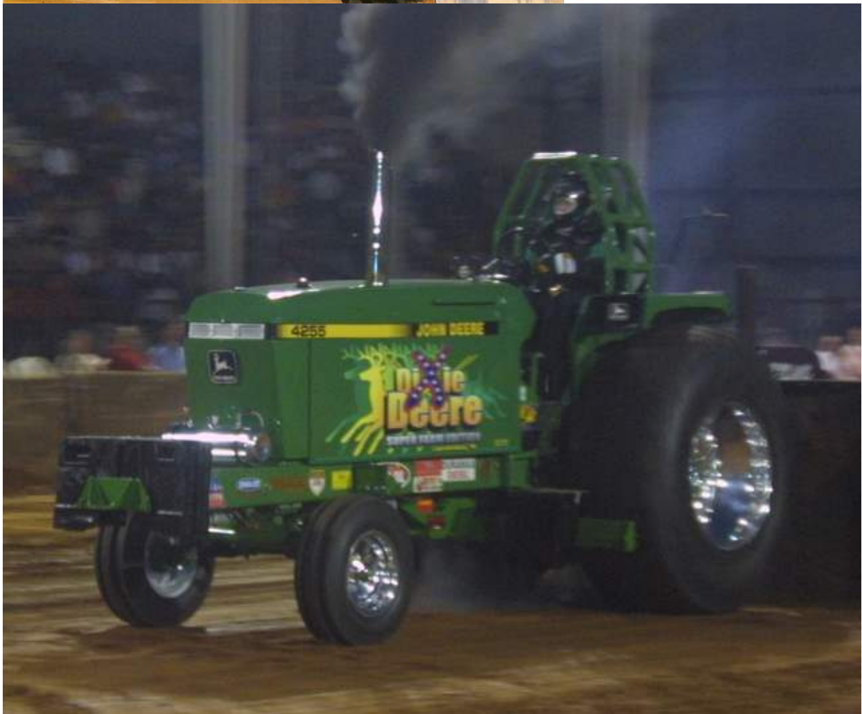
Below, possibly the first ever pass on the Dixie Deere Super Farm at Law- renceburg Tn. in 2005.