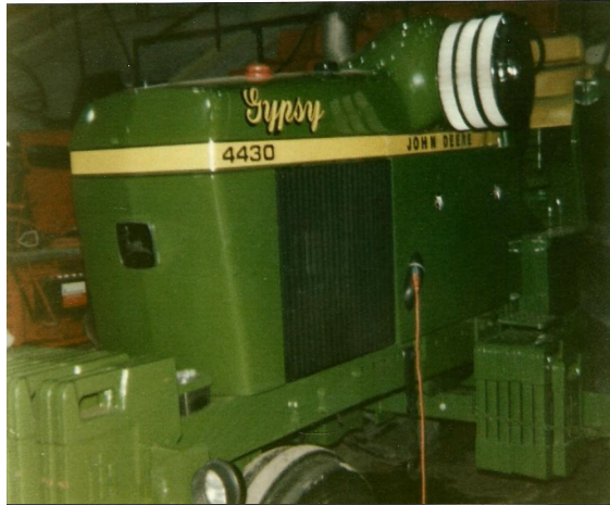
Left, The Gypsy